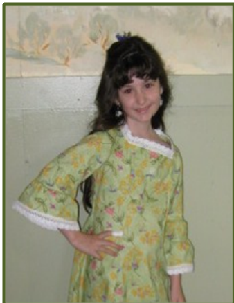
4-H member shows garment entered into Fashion Revue.