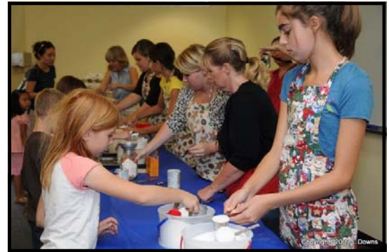
4-H Club assembling cookie mix jars to give to the Children's Receiving Home.

Young people need opportunities to develop skills, knowledge and a variety of other personal and social assets conducive to healthy development. Programs that offer young people safety, supportive and caring relationships with adults and peers, involvement in decision-making, opportunities for leadership, community involvement, and skill building lead to positive youth and early adult outcomes.