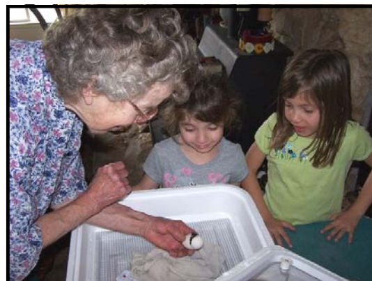
Witnessing the baby chick's debut as it completes the hatching process.

The 125 incubators, equipped with automatic turners supply hundreds of classrooms, afterschool and preschool programs, as well as home schooled families participating in the 4-H embryology project.