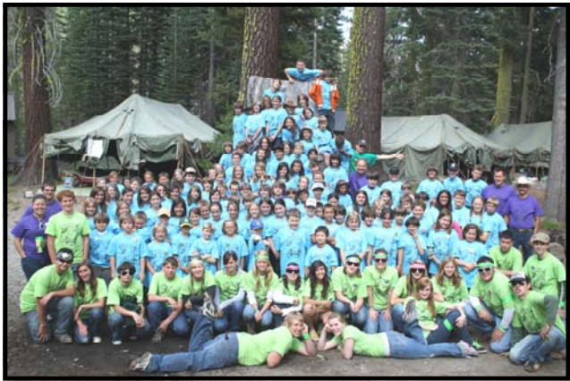
4-H members and adults who participated in the Nevada County 4-H Summer Camp Program.

organize and implement the camp program with the support and guidance of adult volunteers.