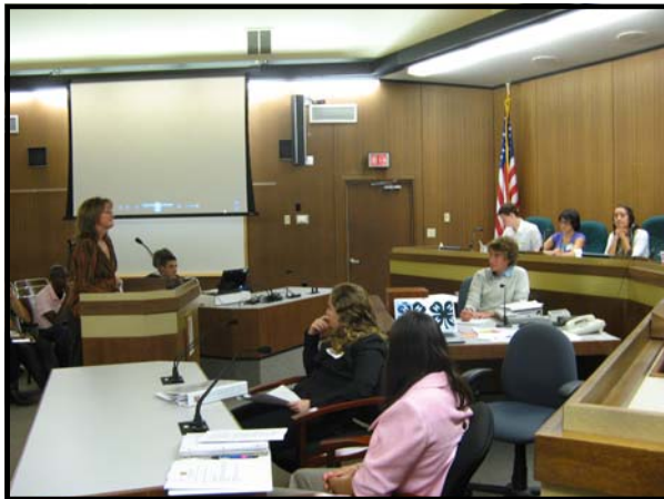
Community Member from Full Circle Treatment Center presents to the Youth Commission.

Research shows that engaging youth in civic activities is the most effective way to promote civic identity formation and subsequent civic engagement in adulthood. In addition, young people want to create positive change in their communities and feel that to truly impact issues affecting youth, youth need to be part of the solution.