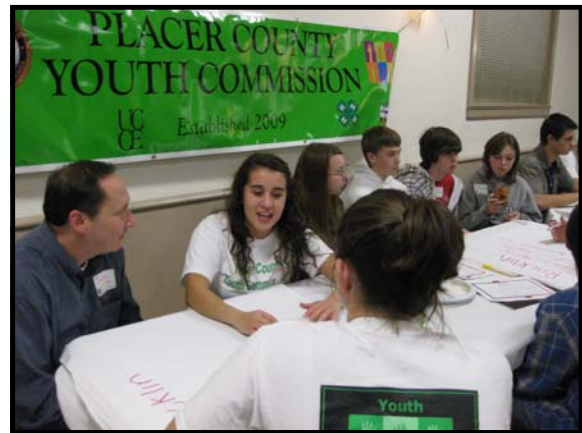
Youth and adults discuss the topic of underage alcohol use.

Many youth felt that parents didn't have a true picture of teen drinking or understand how to prevent it. In response, the Youth Commission held two Community Town Halls Events. A panel of adults and local high school students discussed the current situation of teen drinking and how parents can help them make better choices. Over 140 youth and parents attended. The Commission is organizing merchant stings with law enforcement to reduce sales to minors.