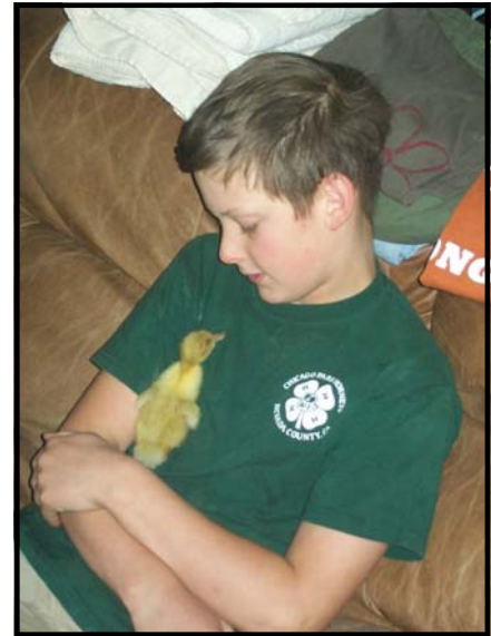
4-H member cares for newly hatched chick.