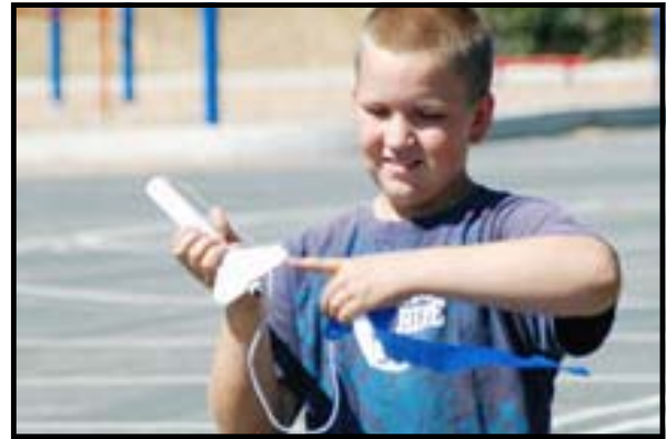
4-H member explores the rocket he built before launching.

The U.S. faces a significant challenge as young people are not prepared with the necessary science, technology, engineering, and mathematical knowledge, skills, and abilities to compete in the global market. For over a decade, national and international assessments of science education and literacy have shown that U.S. youth perform at levels below those achieved by their peers in many developed countries. To address these needs locally and nationally, 4-H programs across the nation launched a five-year 4-H SET (Science, Engineering, and Technology) initiative to reach new youth with 4-H SET experiences.